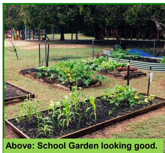
Above: School Garden looking good.